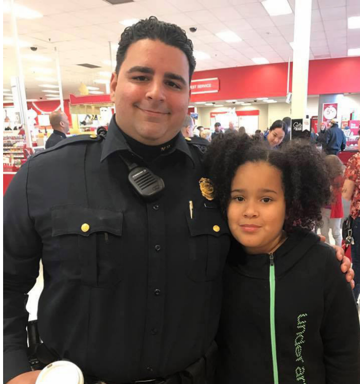
A project of the Community Foundation of Southeastern Massachusetts.